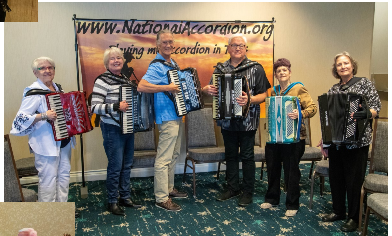
Tulsa Accordion Band