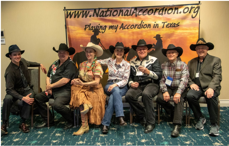
Entertainers & Presenters