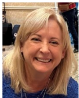
OAC Meetup April 14, 2024