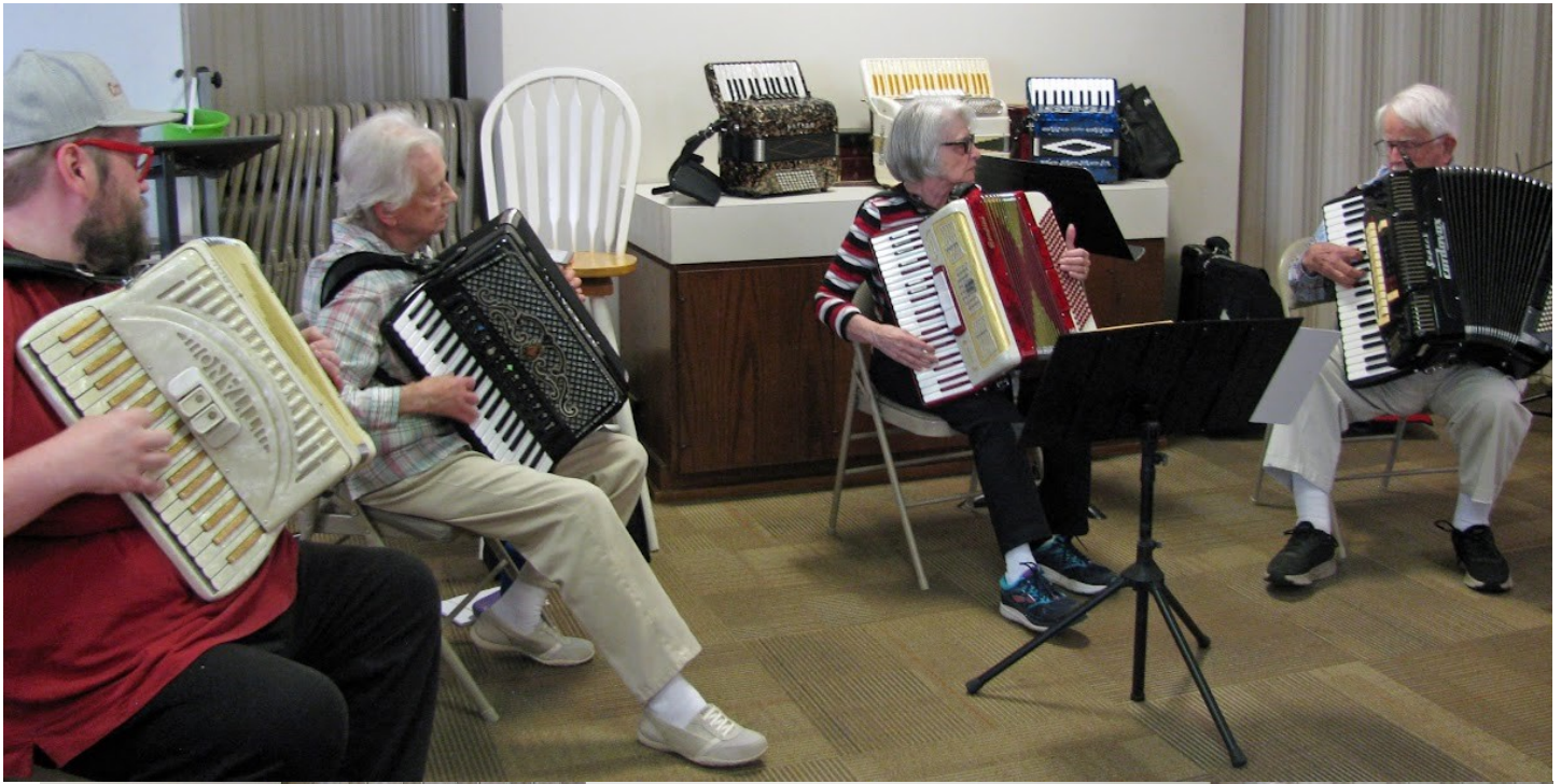
April 14, 2024 Meetup